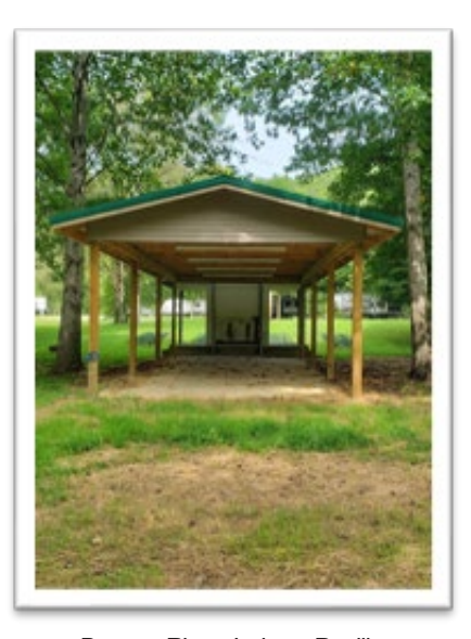
Barren River Lake - Pavilion