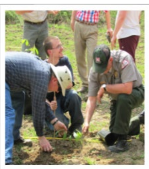
Carr Creek Lake - Chestnut Orchard