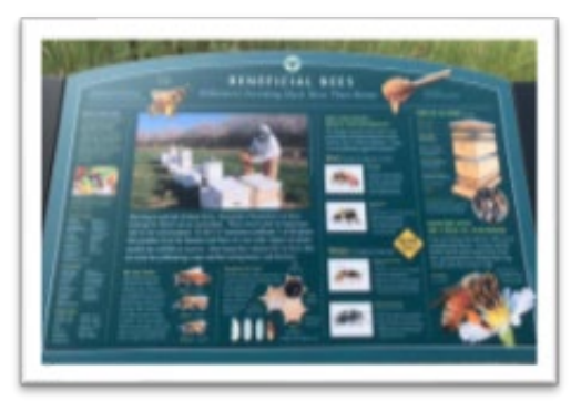
Carters Lake - Pollinator Project