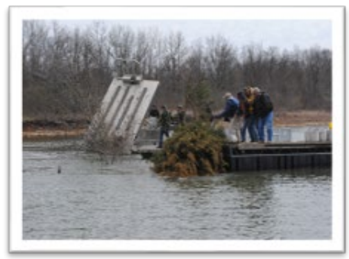
Smithville Lake - Habitat Enhancement