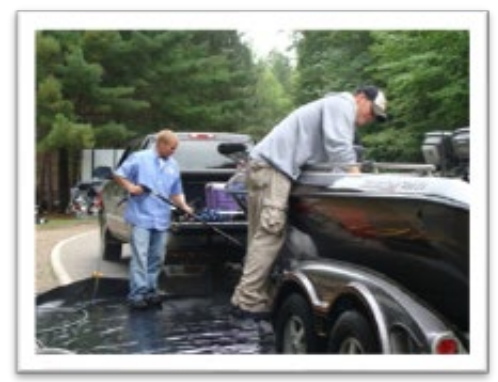
Gull Lake - Invasive Species Wash Station

Over the past twenty years, HQUSACE has made $3.6 million in "seed money" av ailable through the Handshake Program.